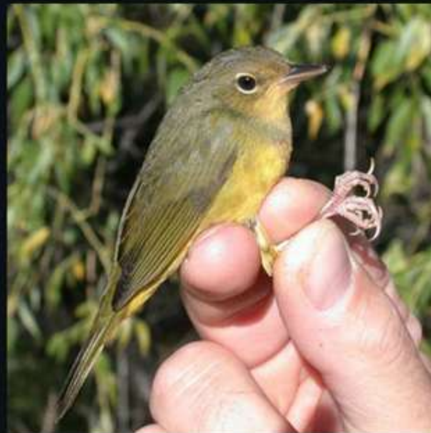
Mourning Warbler, first fall (6th documented fall CO record) Barr Lake Banding Station, Adams County, Colorado 25 September 2001