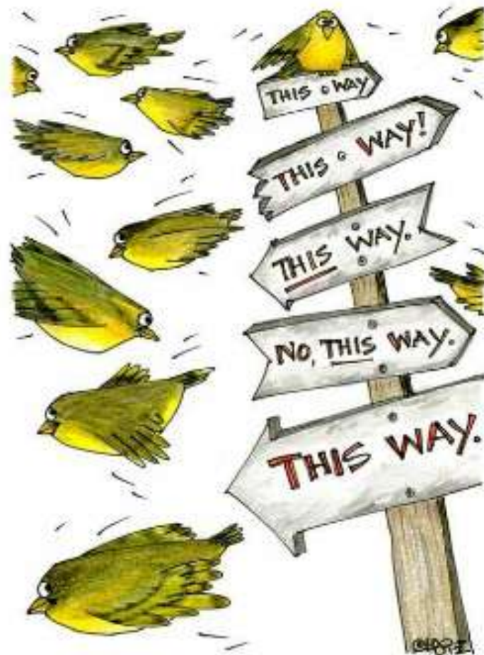
CONFUSING FALL WARBLERS .